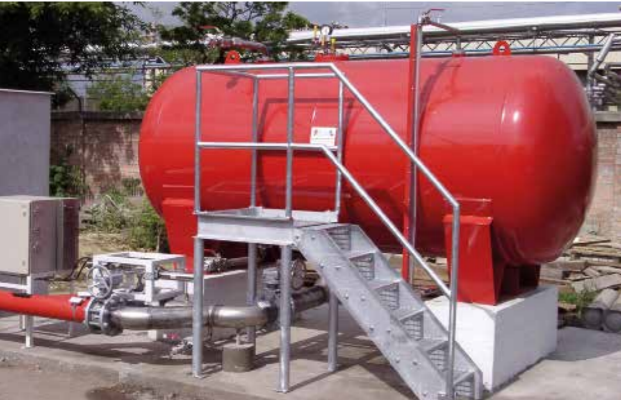
◀ A typical above-ground Pi Foam pressure vessel. Today, the bigger ones are almost always stored underground.

burning liquids get hot enough to dissipate the foam with greater ferocity once it arrives. Instead of the foam extinguishing the fire, the fire consumes the foam.